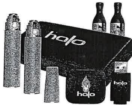
One popular e-cigarette starter kit.

EXCERPT: 4-25-14 DEL HOUSE OF REPRESENTATIVES REPUBLICAN CAUCUS E-NEWS LETTER